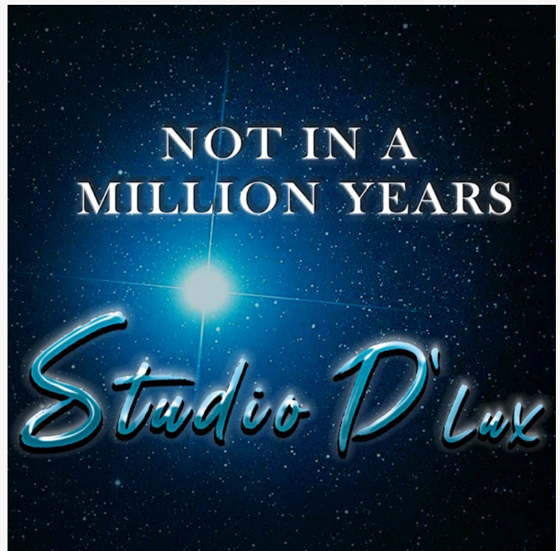
Studio D'lux - "Not in A Million Years"