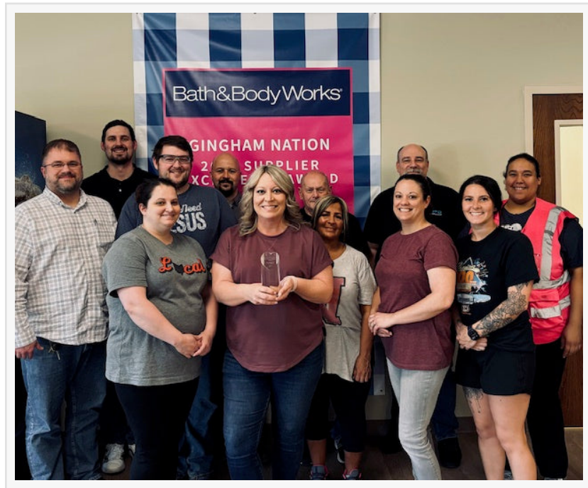
Team APG Ohio

needs. From innovative designs to reliable production, the team is dedicated to delivering excellence in every project. For those seeking top-tier packaging solutions, connecting with one of APG's packaging specialists can help find the perfect fit for any business.