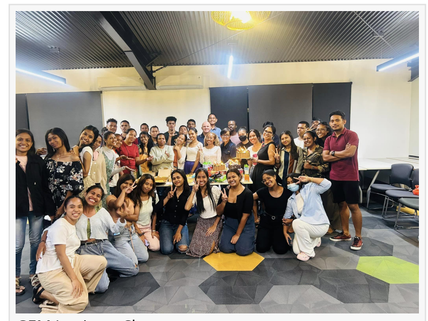
GEM Institute Classroom

"The GEM Institute is the first of its kind in Timor-Leste and focuses on providing a broad range of English language courses designed to equip the people of Timor-Leste with employment-ready skills across the legal, health and wellness, aged care and tourism and hospitality sectors in English speaking environments.