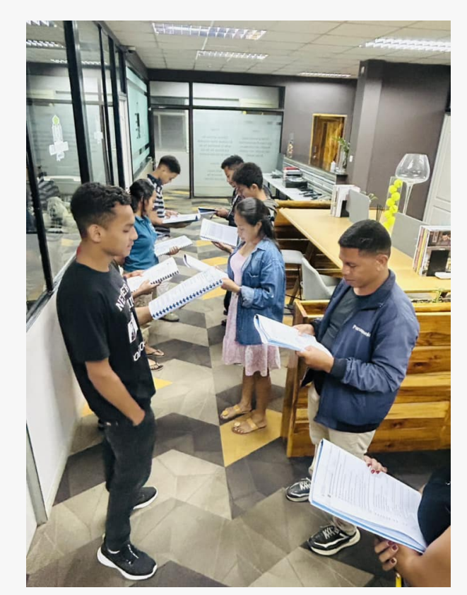
GEM Institute Learning in Action

"The GEM Institute provides much needed industry focused English learning for the people of Timor-Leste. The Australian economy is facing a significant worker shortfall of hundreds of thousands across the health, caring, hospitality and general business sectors. The shortfall represents jobs that urgently need to be filled in order for organisations to deliver essential services and achieve growth.