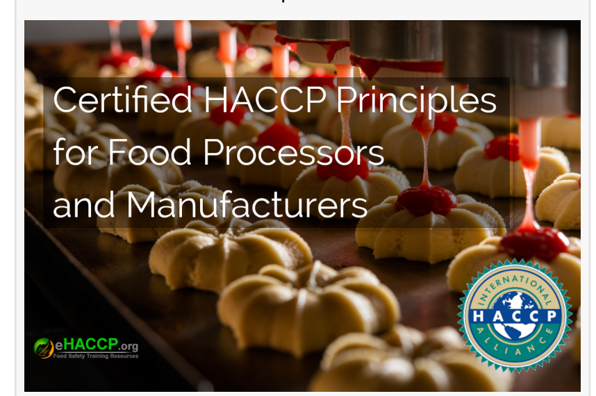
HACCP course name: Certified HACCP Principles for Food Processors and Manufacturers

The 7 steps of HACCP must also be demonstrated, these principles include hazard analysis, CCP identification, establishing critical limits, monitoring procedures, corrective actions, verification procedures, and record-keeping and documentation. The 7 principles of HACCP identify those food production hygiene issues and take actions to prevent them. In this way, instead of inspecting finished products for the effects of these hazards, HACCP attempts to avoid hazards throughout the production process.