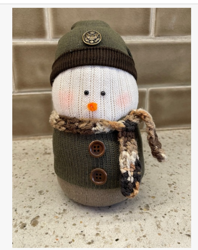
Handcrafted Item for the Ocala Blue Star Mother's Fundraiser

For a small volunteer non-profit group with limited technological skills or