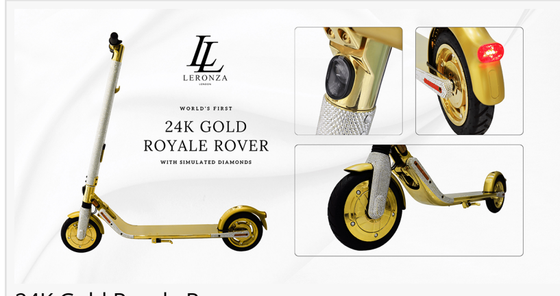
24K Gold Royale Rover

What sets the 24K Gold Segway apart is not just its stunning aesthetics, but also its remarkable performance