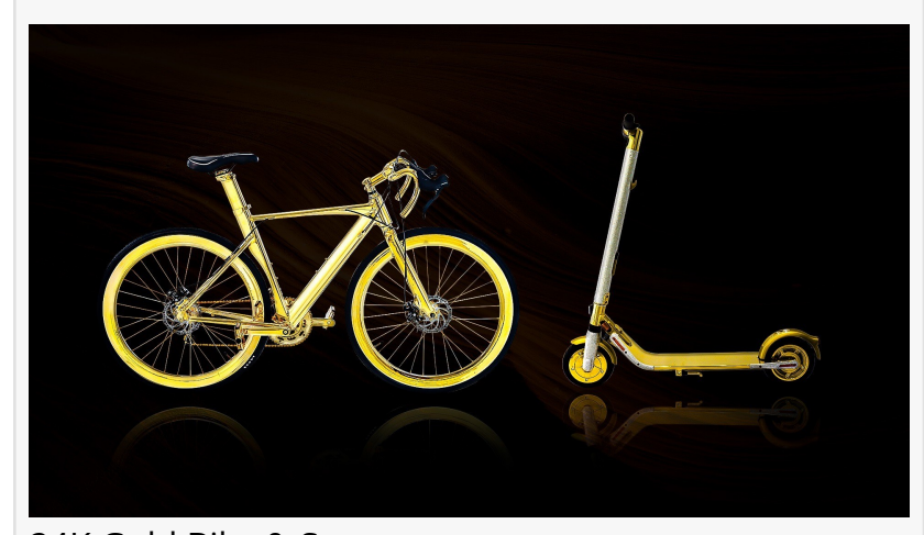
24K Gold Bike & Segway

capabilities. Equipped with a powerful 300W motor, this Segway effortlessly glides across various terrains with ease. Its advanced design allows it to tackle inclines of up to 15 degrees, providing riders with unmatched versatility and control.