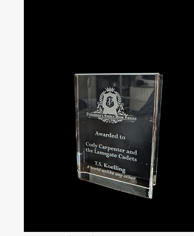
Custom engraved trophy