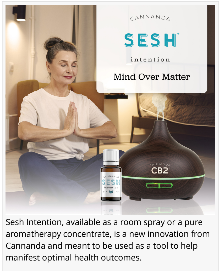
Sesh Intention, available as a room spray or a pure aromatherapy concentrate, is a new innovation from Cannanda and meant to be used as a tool to help manifest optimal health outcomes.