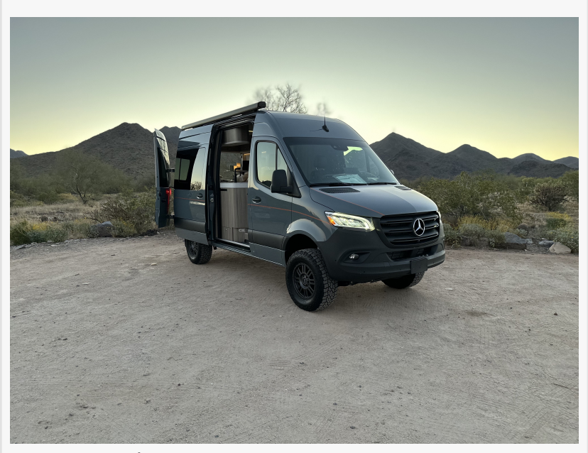
Innova Roadtrip 595L Exterior

yachting solutions and materials, the Innova 595L Roadtrip maximizes space utilization and significantly reduces noise, offering an unparalleled level of comfort and luxury. Key features include: