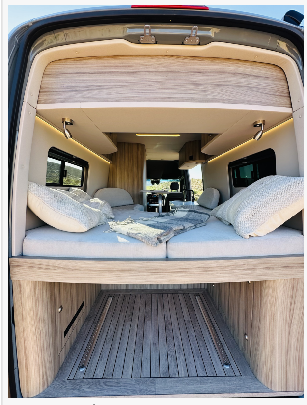
Innova roadtrip 595L Rear view

Renowned for their dedication to excellence and superior customer service, Mercedes-Benz of North Scottsdale and Mercedes-Benz of Chandler are the