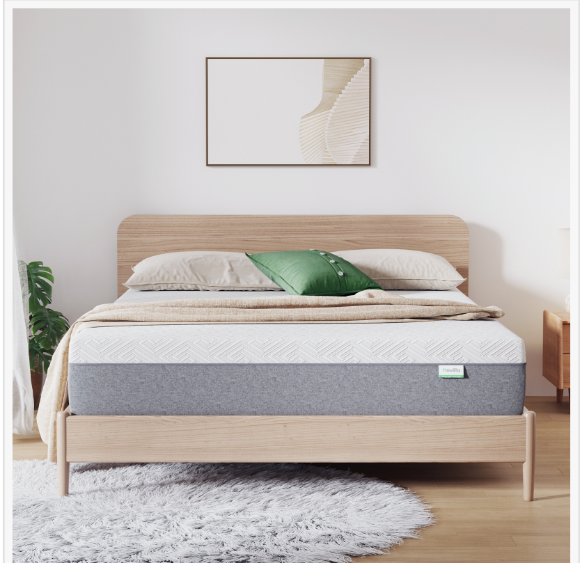
Novilla Bliss Mattress

/EINPresswire.com/ -- In today's crowded mattress market, where numerous options vie for consumer attention, the Novilla Bliss Memory Foam Mattress has carved a niche for itself. It has been recognized with distinctions like "Amazon's Best Buy" and "NYTimes Best Mattress Under $500," which demonstrate its ability to cater to value-conscious shoppers seeking a premium sleep experience without a hefty price tag. These accolades reinforce the reputation of the Novilla Bliss as a market leader in offering exceptional comfort at an accessible price point.