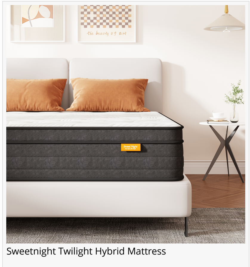
Sweetnight Twilight Hybrid Mattress

Twilight also has a three-zoned support system that's specifically designed to provide personalized pressure relief and support throughout the body. To achieve this, the mattress contains coils of varying firmness in different areas. The central third of the mattress, which is designed to support the lower back and upper body, uses firmer coils to provide the necessary support to these important areas. This helps maintain proper spinal