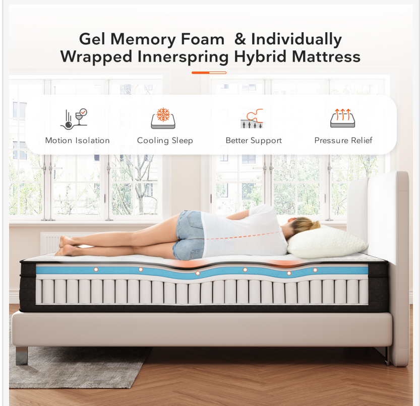
Fits Your Body Curve