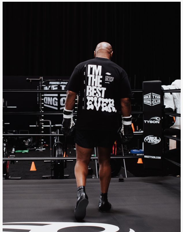
Tyson at his Vegas training camp for Loaded

Asked whether he feels as fit as he did in his youth, Tyson confessed: "No, no. No way. There's just no way I will ever feel as fit as I did in my youth again. I'm just not going to be that guy. That's just not true. I'll lie to you. But then I'm lying to the