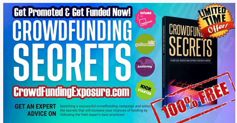
Crowd Funding Secrets GoFundMe Kickstarter Indiegogo CrowdfundingExposure