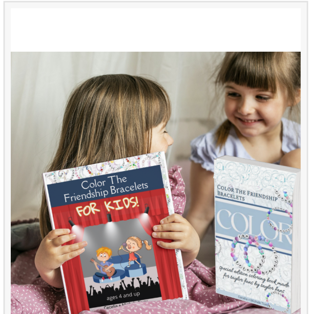
Taylor Swift fans with Friendship Bracelet Coloring Books