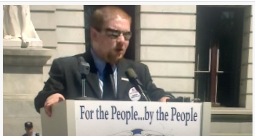
"Voice of the People USA Rally -Harrisburg, PA June 2008

rule of law are more pertinent than ever. In an era marked by political polarization and widespread concerns about governance, the group aims to reignite the spirit of grassroots activism that defined its early years. Voice of the People USA's resurgence is driven by a renewed commitment to supporting President Trump, advocating for America First values, and promoting national unity. The group is once again ready to expose corruption, hold wrongdoers accountable, and preach peace through unity and community engagement. Their message to the American public is clear: use your voices, stand up, and speak out before your rights are taken away. Your voice matters. To kick off their return, Voice of the People USA will hold an inaugural event on June 1 at 5:00 PM at the Knights of Columbus Hall in Fort Kent, Maine, located at 372 Frenchville Road. This event will set the tone for their renewed efforts and provide a platform for supporters to come together.