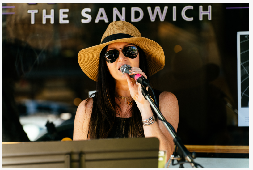
Local musicians playing all genres of music on Make Music Salem