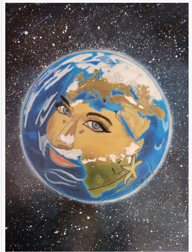
Art by Tracey Chaykin

As Chaykin continues to evolve her artistic practice, she remains focused on the legacy she intends to create—a future where art and environmental stewardship are seamlessly integrated. Her artwork not only showcases the beauty of wildlife and natural landscapes but also serves as a call to action, reminding us of the critical role artists play in driving societal change.