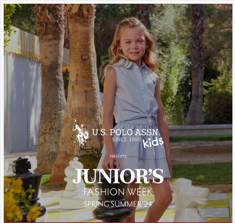
U.S. Polo Assn. Kids x Junior's Fashion Week

JBPL is committed to rendering exceptional services that bolster the market value of the associated brands. With a proven track record of successful luxury children's fashion events across India, organized by Junior's Brands Private Limited, Junior's Fashion Week