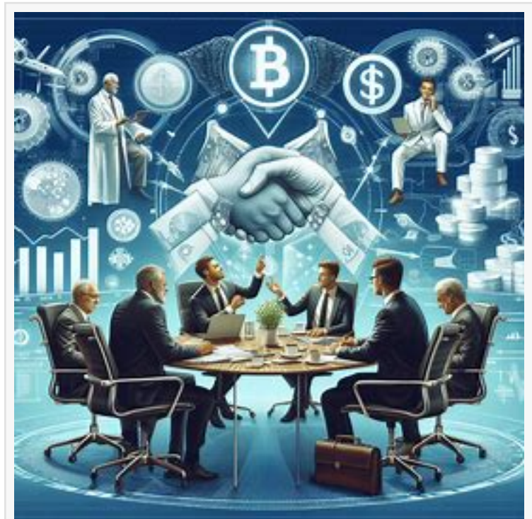
Vcapito Announces Investor-Investee Meet in Las Vegas for July 2024