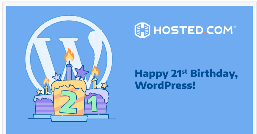
Hosted.com wishes WordPress a Happy 21st Birthday

2005: WordPress Themes - Version 1.5 introduced themes, enhancing design flexibility for users.