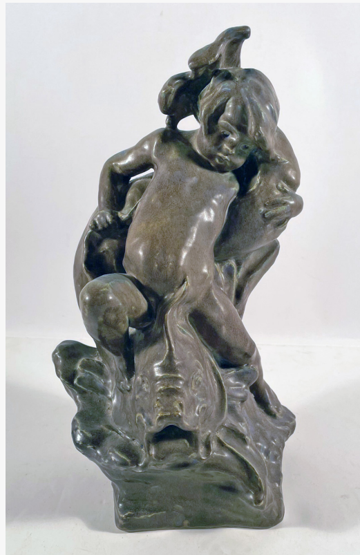
1912 Rookwood Pottery sculpture of Greco-Roman child sea-god Palaimon riding dolphin. Designed by Clement Barnhorn. Matte gray/green glaze. Marked on interior with Rookwood logo and shape #2019. Height: 15in. Estimate: $1,000-$1,500