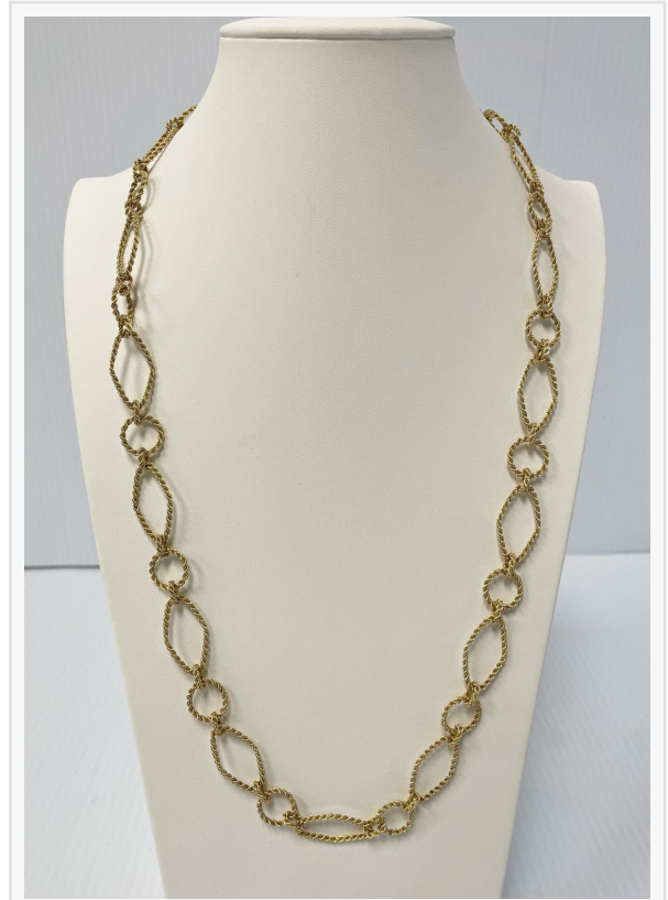
Chic 14K gold rope-link chain necklace with alternating navette and circular links. Length: 28in. Estimate: $2,000-$3,000