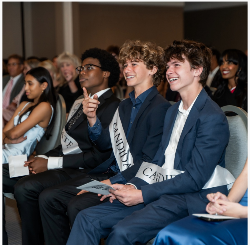
Students gained valuable leadership and professional skills

Coming off the major success of the spring program, the Amalfi Foundation announced that they launched the Summer SLA program, which will run from June until mid-October.