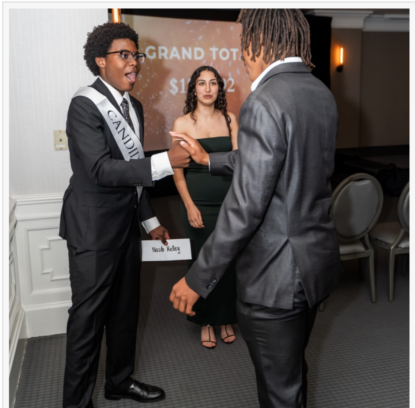
The night celebrated students achievements

The new program serves as a testament to the success we have seen over the last two program cycles, and we are eager to continue and make a greater positive impact in our community," Jones said.