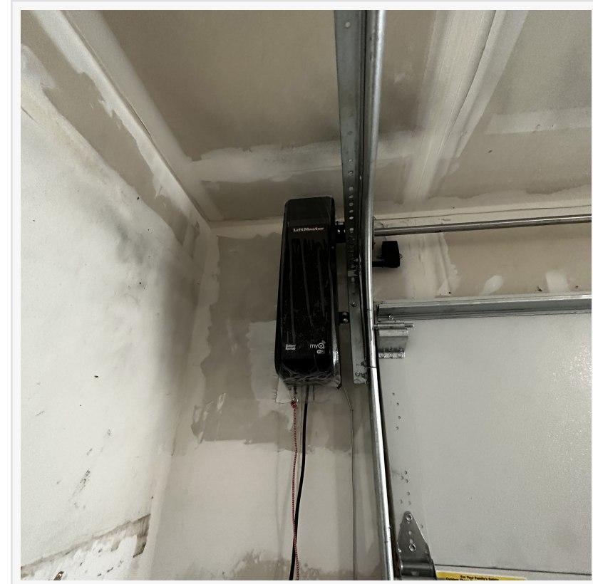
emergency garage door repair

Another advantage of consistent maintenance is the ability to prolong the life of a commercial garage door. A garage door that is well taken care of can operate properly for many years without significant repair or replacement needs—this saves businesses money over time and keeps them running smoothly without much interruption.