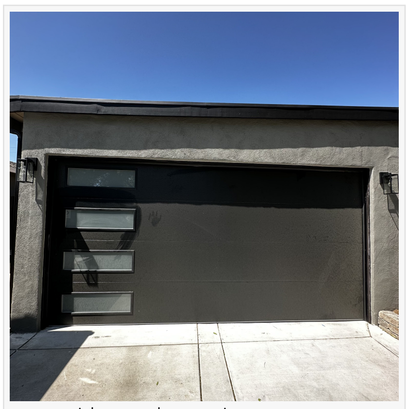
commercial garage door repair

This press release can be viewed online at: https://www.einpresswire.com/article/714565453