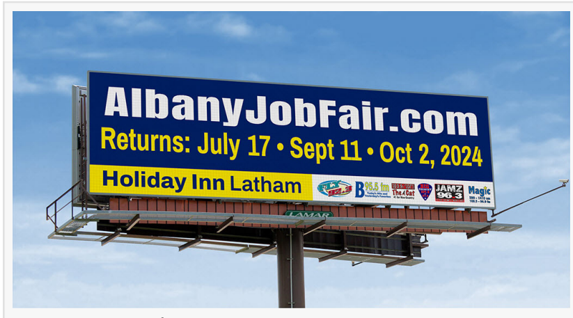
AJF Returns July, Sept, Oct

Recruiters confirmed to be on site include: AIM Services, Albany Broadcasting, Albany Med, Albany Police, Albany VA Med Ctr, Anchor Health, Berkshire Farm, Berkshire Health, BSNB, Cap Region BOCES, CD Choices, City of Albany, Conifer Park, Dept of Public Service, Dept of Corrections, Express Employment, Favorite Healthcare, Frito Lay, Fusco Personnel, Glenmont Job Corps, Hana Industries, Healthy Alliance, Holiday Inn, Home Instead, Hometown Health, HVCC, International Paper, Interprint, Janitronics, KIPP Capital Region PS, Lexington ARC, Local 669, McLane Albany, Nassau Financial, Nathan Littauer, Nationwide, NY Army Nat Guard, NY Creates, NY Life, NY State of Health, NYS Children/Family, NYS Comptroller, NYS Dept of Labor, NYS Dept of Health, NYS DMV, NYS Insurance Fund, NYS OGS, NYS People with Dev/Dis, NYS Tax & Finance, NYS Teachers' Retirement, NYS Troopers, NYS Unified Court, Office of Medicaid IG, Price Chopper, RedShift Recruiting,