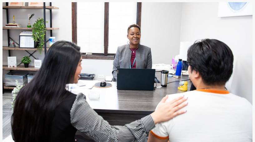
A family therapy session at Sandstone Care