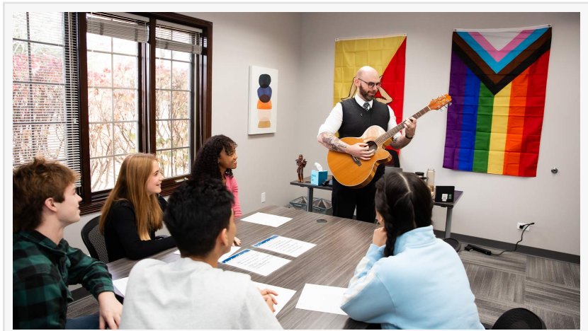
An academic and vocational support group at Sandstone Care

For those interested in learning more about treatment options, Sandstone Care's Towson facility offers 24/7 support at (888) 611-4251. The center is also in-network with most major insurances and provides instant verification of benefits, ensuring transparency in program costs.