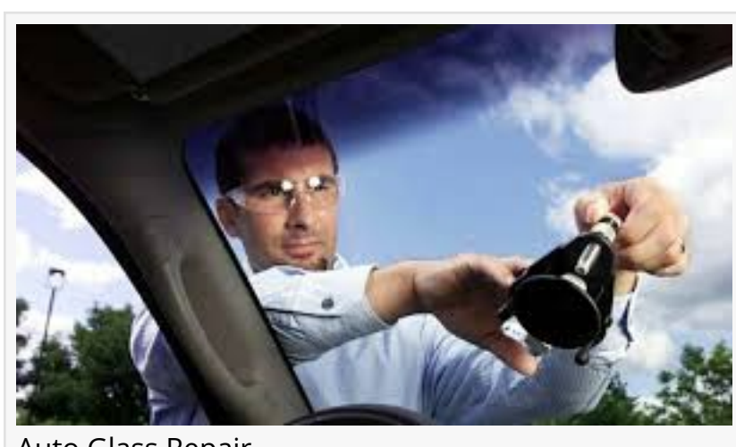
Auto Glass Repair

HOUSTON, TEXAS, UNITED STATES, May 27, 2024 /EINPresswire.com/ -- In the realm of vehicle maintenance, windshield repair stands out as a crucial aspect that can affect both safety and cost. Understanding the role of insurance in this process is essential for vehicle owners. This press release aims to shed light on how insurance