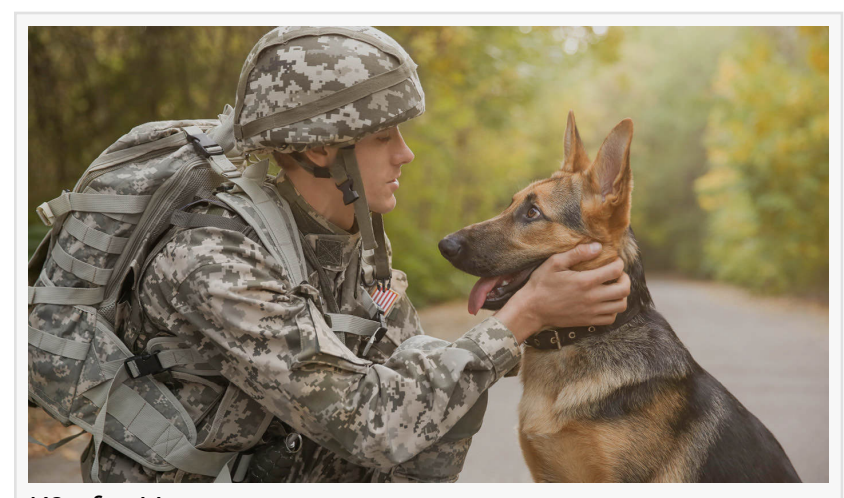
K9s for Veterans

Akathisia symptoms can include intense inner and outer restlessness, agitation, delirium, cognitive confusion, and unusual thoughts and behaviors. A wide variety of medications are associated with akathisia, including but not limited to drugs prescribed for