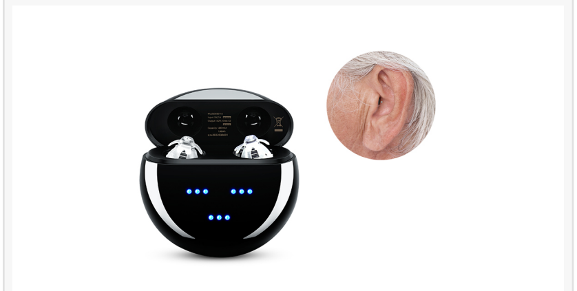
Chosgo SmartU rechargeable otc hearing aids