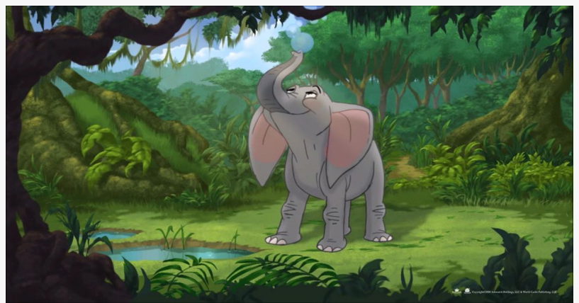
Thunder Looking Up at the World

SCOTTSDALE, ARIZONA, USA, May 28, 2024 /EINPresswire.com/ -- In a world fraught with environmental challenges, the search for a powerful and unifying voice to inspire action has led us to an unexpected hero from a beloved children's book series: Thunder the Elephant . Known for his gentle wisdom and kind heart, Thunder is poised to become the tender yet compelling spokesperson we need to galvanize the world into action against climate change.