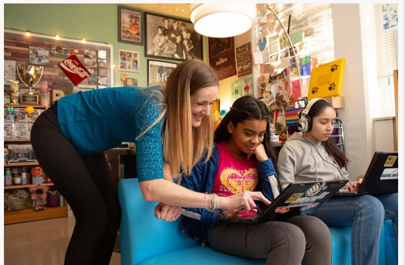
A teacher supporting students on their Impacter Pathway journey.