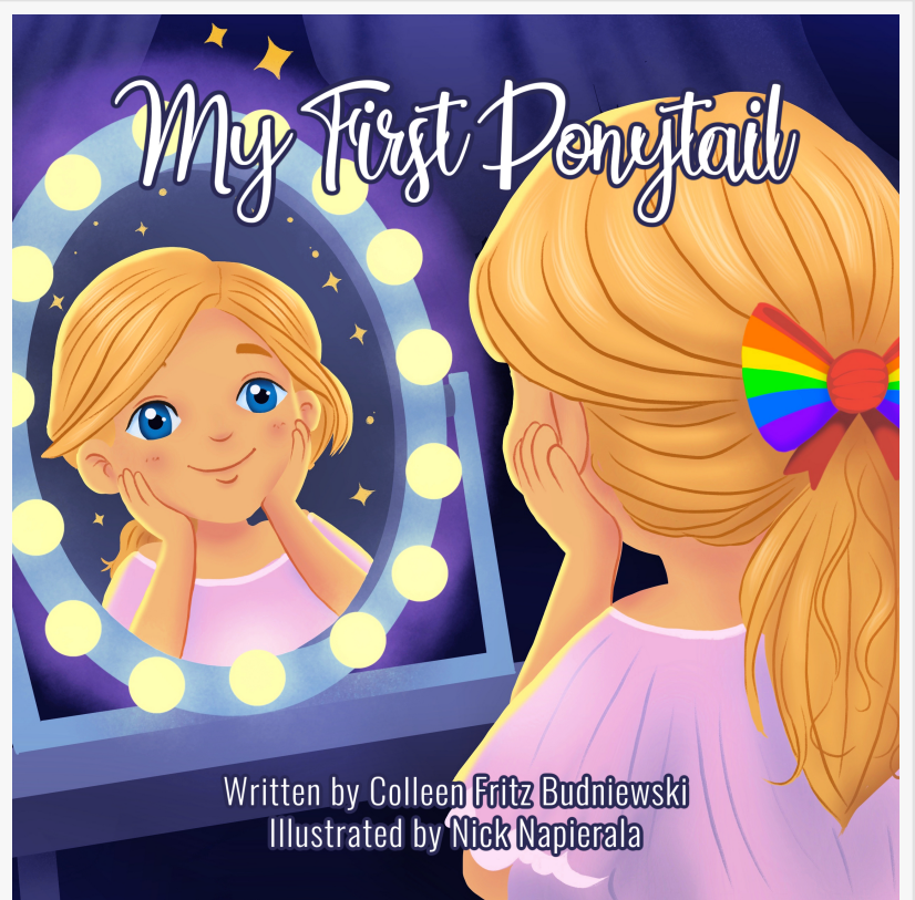
My First Ponytail Book Cover

This press release can be viewed online at: https://www.einpresswire.com/article/715576323