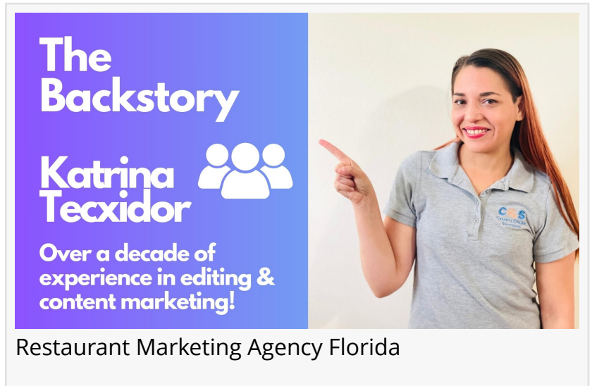
Restaurant Marketing Agency Florida

ALTAMONTE SPRINGS, FLORIDA, UNITED STATES, June 15, 2024 /EINPresswire.com/ -- "COSMarketing Agency: Revolutionizing the Way Restaurants Advertise with One-Stop Shop Solutions":