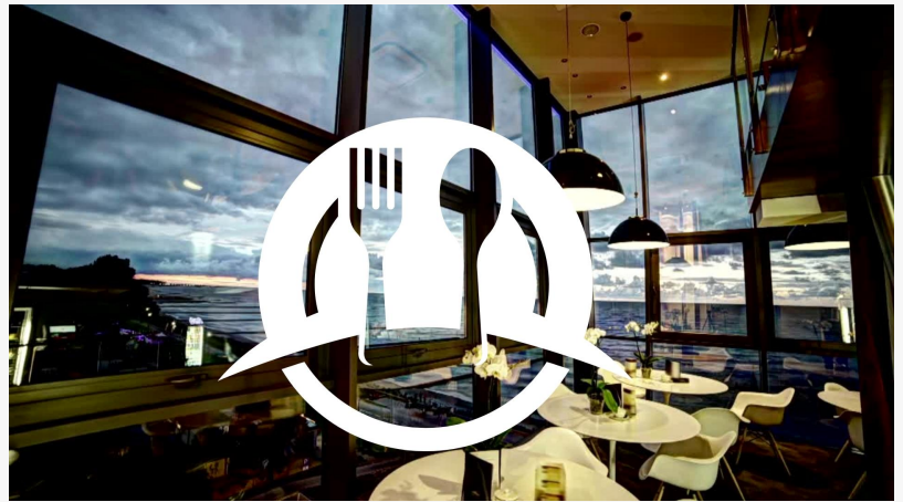
Florida Restaurant Digital Marketing Agency