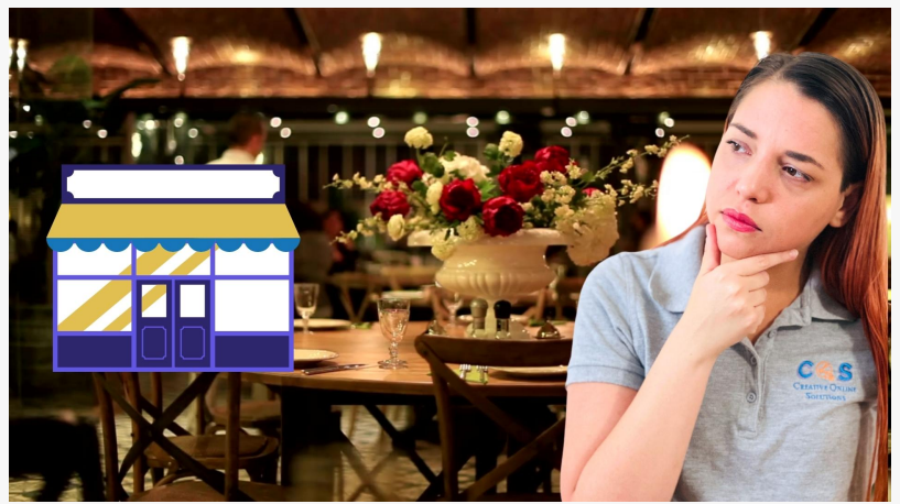
Restaurant Marketing Strategy Agency Florida

Targeted Advertising Campaigns use data-driven insights. They develop and run effective ads on