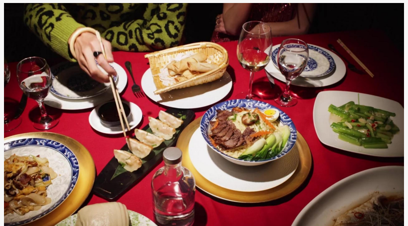
Florida Family Owned Restaurant Marketing Company