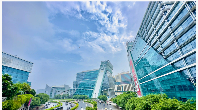
Gurugram (Cyber City) India