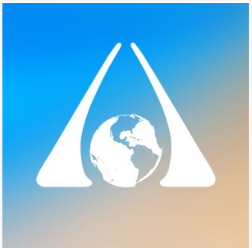
ARYA INC - A New World of Integrated Enterprise Communications

During the technology summit, the group addressed and developed solutions using ARYA's cutting-edge system to improve data-loss prevention and intrusion detection, and prevent AI-generated threats, shielding against digital impersonations including deepfake video & voice, thus increasing transparency and trust.