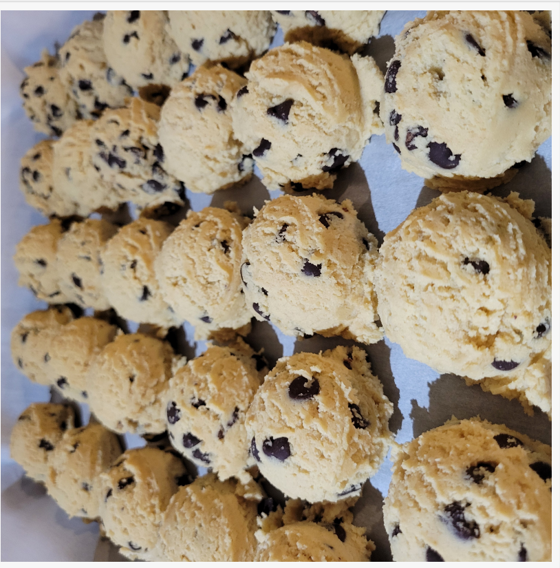
Ready to Bake Chocolate Chip Cookies

Jocelyn Healy Seriously Sweet Inc. info@seriouslysweet.ca Visit us on social media: Facebook Instagram