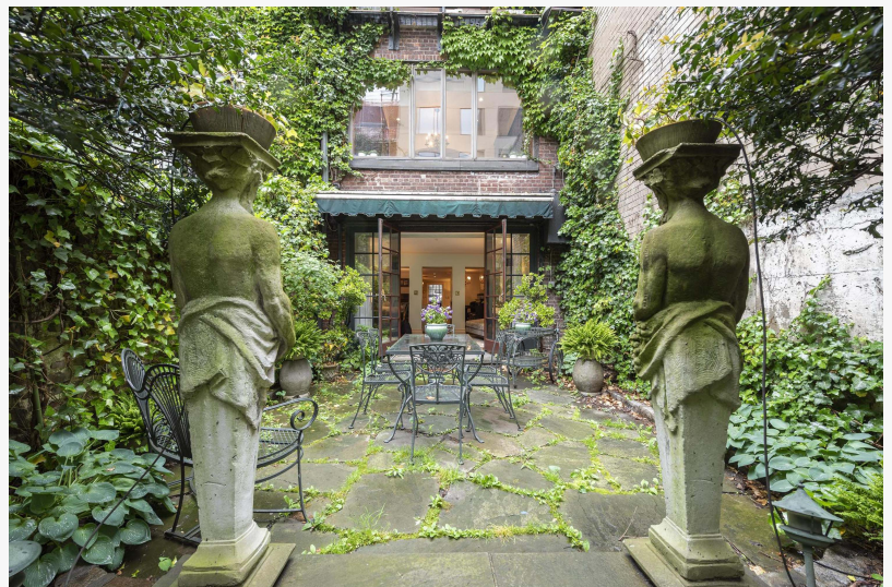
162 East 63rd Street, Upper East Side, New York, New York

This press release can be viewed online at: https://www.einpresswire.com/article/715655049 EIN Presswire's priority is source transparency. We do not allow opaque clients, and our editors try to be careful about weeding out false and misleading content. As a user, if you see something we have missed, please do bring it to our attention. Your help is welcome. EIN Presswire, Everyone's Internet News Presswire™, tries to define some of the boundaries that are reasonable in today's world. Please see our Editorial Guidelines for more information. © 1995-2024 Newsmatics Inc. All Right Reserved.