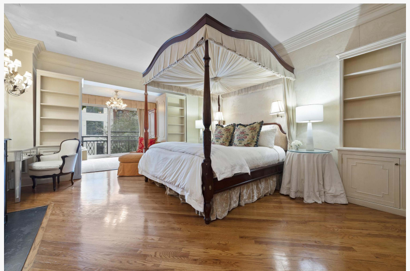
162 East 63rd Street, Upper East Side, New York, New York