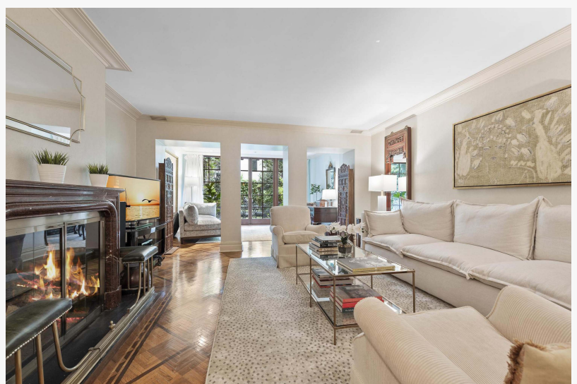
162 East 63rd Street, Upper East Side, New York, New York

Concierge Auctions is the world's best luxury real estate auction marketplace, with state-of-the-art digital marketing, property preview, and bidding platform. The firm matches sellers of one-of-a-kind homes with some of the most capable property connoisseurs on the planet. Sellers gain unmatched reach, speed, and certainty. Buyers receive curated opportunities. Agents earn their commission in 30 days. Acquired by Sotheby's, the world's premier destination for fine art and luxury goods, and Anywhere Real Estate, Inc (NYSE: HOUS), the largest full-service residential real estate services company in the United States, Concierge Auctions continues to operate independently, partnering with real estate agents affiliated with many of the industry's leading brokerages to host luxury auctions for clients. For Sotheby's International Realty listings and companies, Concierge Auctions provides Sotheby's brand exclusivity as Sotheby's Concierge Auctions. Since inception in 2008, the firm has generated billions of dollars in sales, broken world records for the highest-priced homes ever sold at auction and conducted auctions in 46 U.S. states and 38