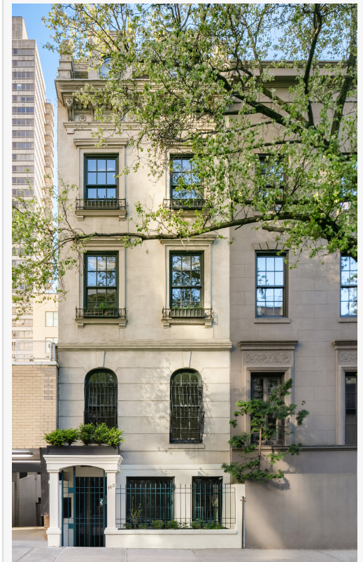
162 East 63rd Street, Upper East Side, New York, New York

Renowned for its historic connections to America's elite families, the remarkable townhouse embodies the neighborhood's legacy of luxury. Just moments from Central Park, it offers a peaceful retreat from the city's bustle. Madison Avenue's upscale boutiques and cultural landmarks like the Metropolitan Museum of Art are within easy reach, defining the essence of New York's refined lifestyle.