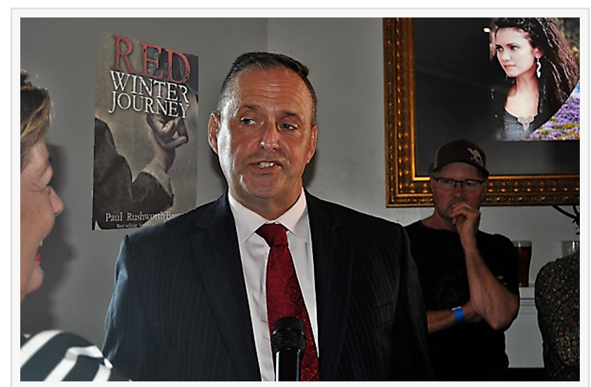
Paul expresses immense gratitude for the unwavering support his readers

LONDON, UNITED KINGDOM, May 30, 2024 /EINPresswire.com/ -- "Step into the captivating world of cult classic writers, where pioneers of their craft beckon with fiercely unique narratives that defy convention. Dive into realms where their work, once shrouded in mystery or controversy, now emerges into the limelight, captivating audiences with its undeniable allure. From instant fame to lingering