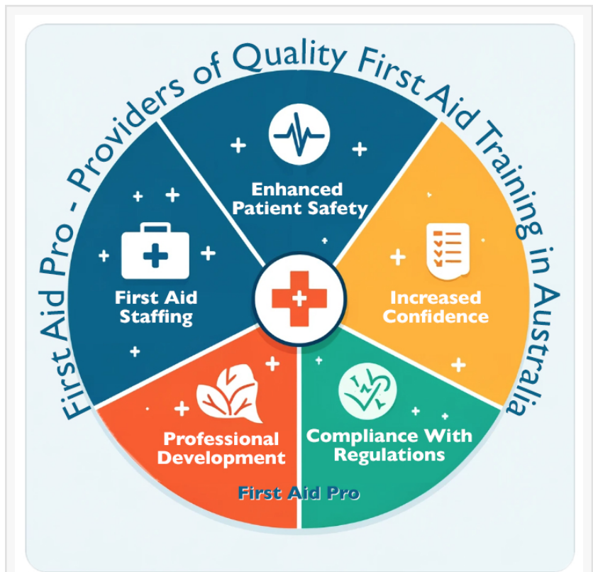
First Aid Pro Infographic of The Benefits of First Aid Training

First Aid Workplace Requirements in Adelaide