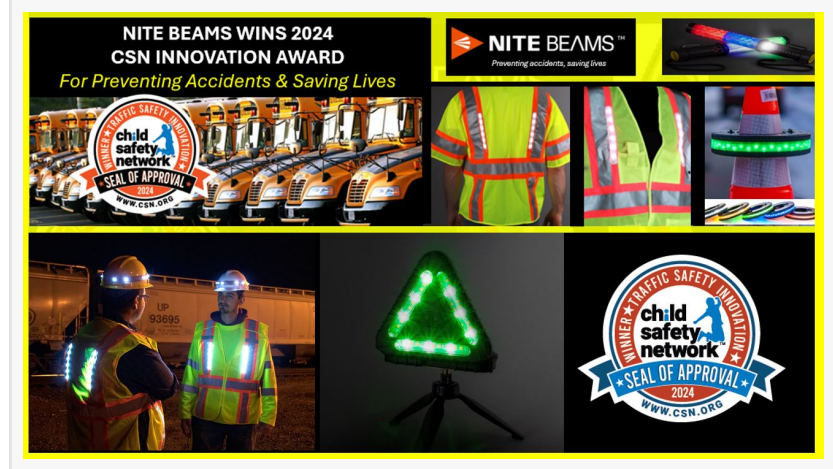
See the Products: https://www.nitebeams.com/products

On any given school day hundreds of school buses are stranded on the side of the road, exposing children and motorists to dangerous situations. What Nite Beams has created is an amazing group of products that can provide ample warning time to motorists to slow down and move over. Protecting our students on school buses, enabling school district crossing guards to be seen sooner and at greater distances and even protecting you and your loved ones when you're s stuck on the road is paramount to CSN."