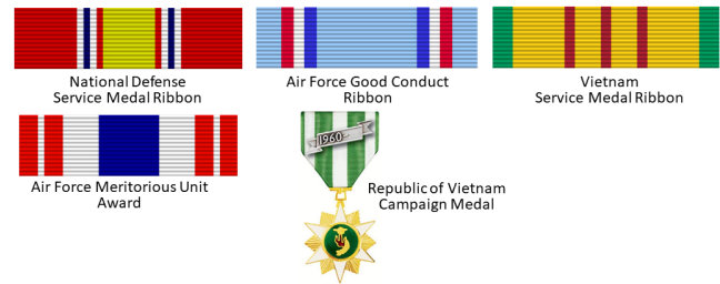
Air Force Ribbons

Uncommon: A Black Man's Journey (Volume 1) is not just a memoir but a witness to resilience,