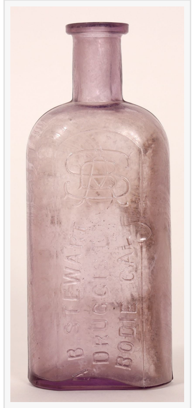
Day 4 lots include a choice purple color bottle for "A B Stewart / Druggist / Bodie, Cal.". The bottle, never washed, displays beautifully, with only a very small ship (est. $500-$1,000).

Noteworthy Day 4 lots include a choice purple color bottle for "A B Stewart / Druggist / Bodie, Cal.". The bottle, never washed, displays beautifully, with only a very small ship (est. $500-$1,000); and a rare territorial token for "The Antlers / Prescott / A.T. (Arizona Territory) / L.A. Rub. Stamp Co. / Good For / 12 ½ Cents / At The Bar", round, 21 mm, R9 (est. $400-$800).