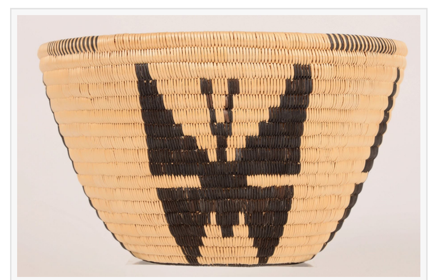
Lot 1135 is a beautiful Panamint butterfly basket made by Molly Bellas of Lone Pine. It took her ten years to complete this work. Four large butterflies adorn the sides. (est. $1,000-$4,000).

RENO, NV, UNITED STATES, May 30, 2024 /EINPresswire.com/ -- Holabird Western Americana Collections, LLC will greet the warm weather with a little heat of their own, in the form of a huge, four-day American History & Hall of Fame Showcase auction, June 6th thru 9th, online and live in the gallery located at 3555 Airway Drive in Reno, starting each day at 8 am Pacific time. A staggering 2,335 lots will come up for bid.