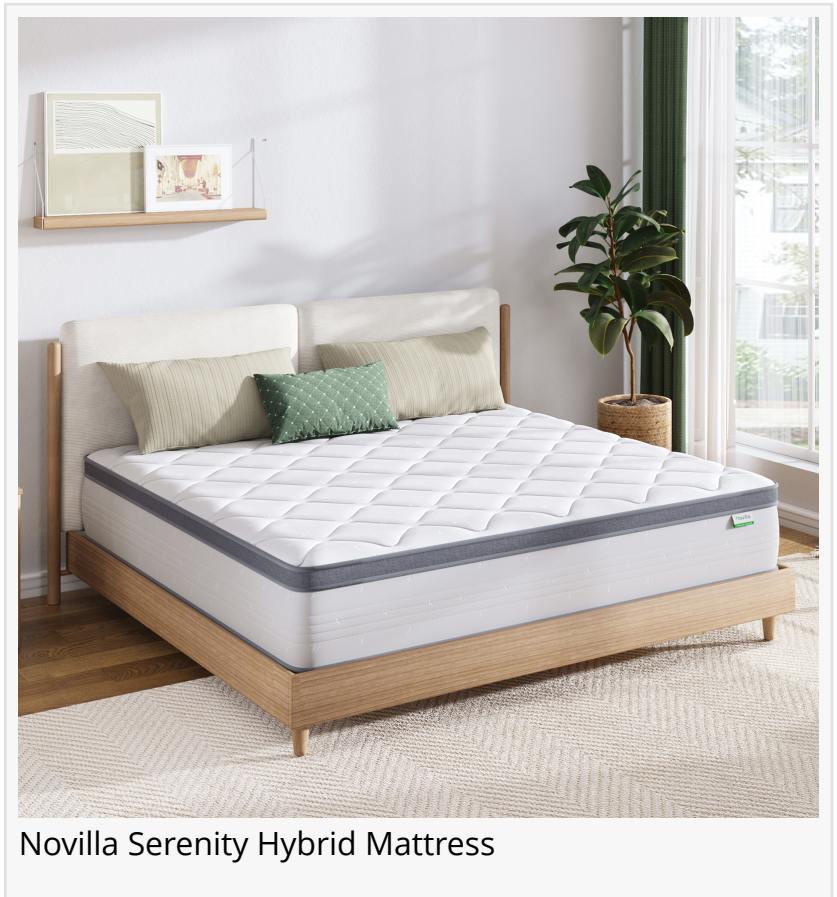
Novilla Serenity Hybrid Mattress

In response to this trend, the Novilla Serenity Hybrid mattress has been designed to offer a range of potential benefits to sleepers. The mattress's construction and choice of materials make it particularly suitable for those who suffer from back pain and overheating.