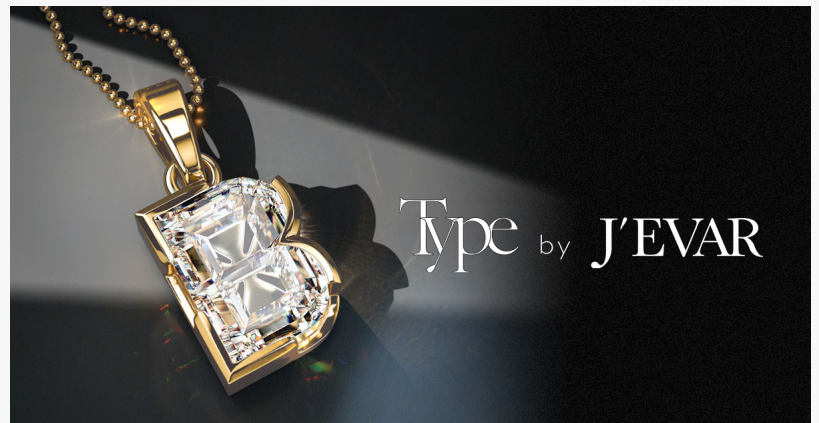
TYPE by J'EVAR Diamond Initials