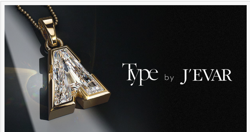
TYPE by J'EVAR Diamond Initials