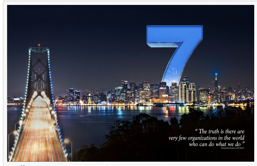
Brilliance you cannot ignore

Konnect Manufacturing showcases the power of gen Al agents to solve real-world challenges for manufacturers.