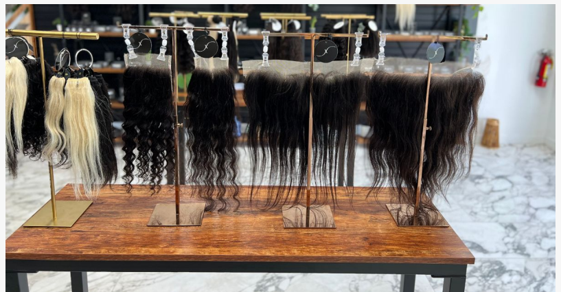
Private Label Showroom Atlanta