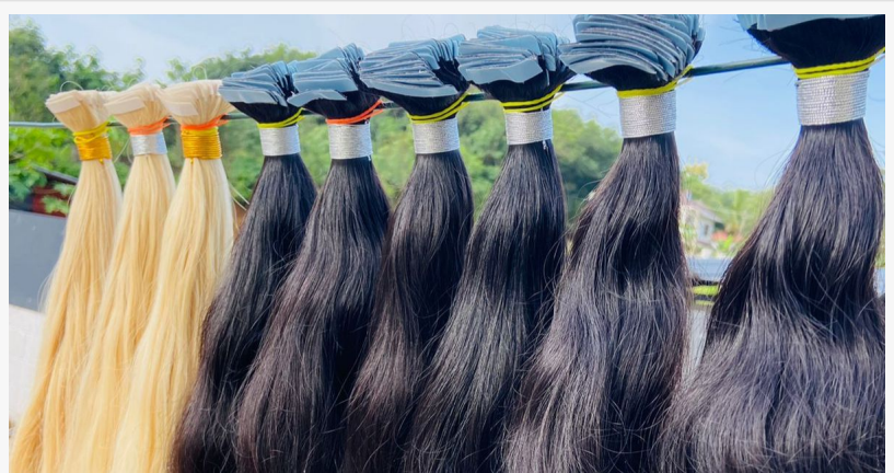
Indian Tape-in Extensions

For more information, please visit www.PrivateLabelExtensions.com .