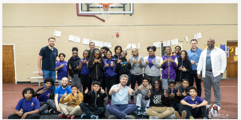
Students at Granville T. Woods Academy of Innovation are harnessing the power of AI to learn and solve business social issues.