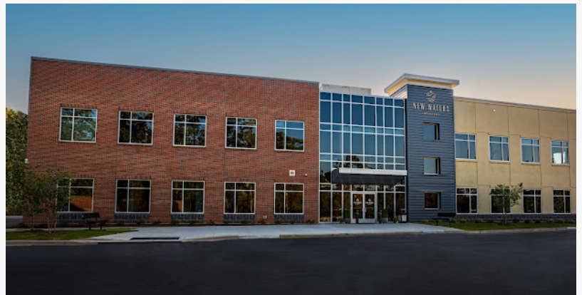
New Waters Recovery Building