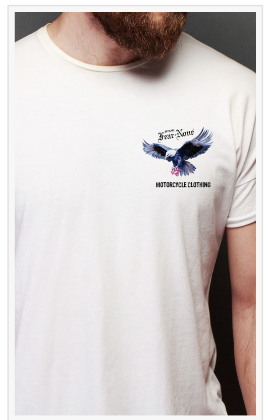
FEAR-NONE motorcycle clothing's newest vintage collection

The 15-piece collection features FEAR-NONE's renowned biker-stamp shirts, multiple renditions of classic skulls, and American Eagles. True to the FEAR-NONE brand, every item is 1000% designed and made in the USA. This collection particularly celebrates the essence of FEAR-NONE's classic American motorcycle heritage, embodying old-school craftsmanship and authenticity. Each piece reflects FEAR-NONE's enduring legacy as a global symbol of USA-Made excellence and dedication to original, classic American values.