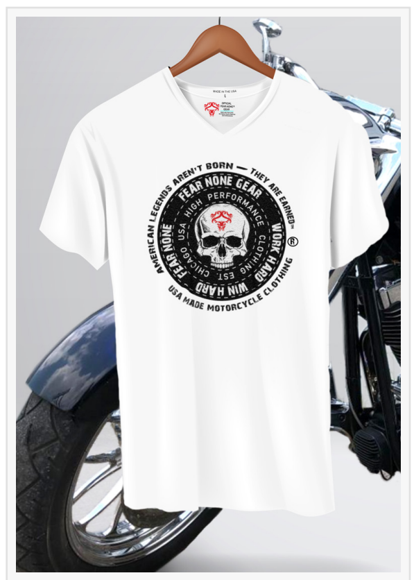
FEAR-NONE motorcycle clothing's newest 2024 collection

Wild Bill FEAR-NONE Motorcycle Gear info@fear-none.com Phone: 1-866-212-3267