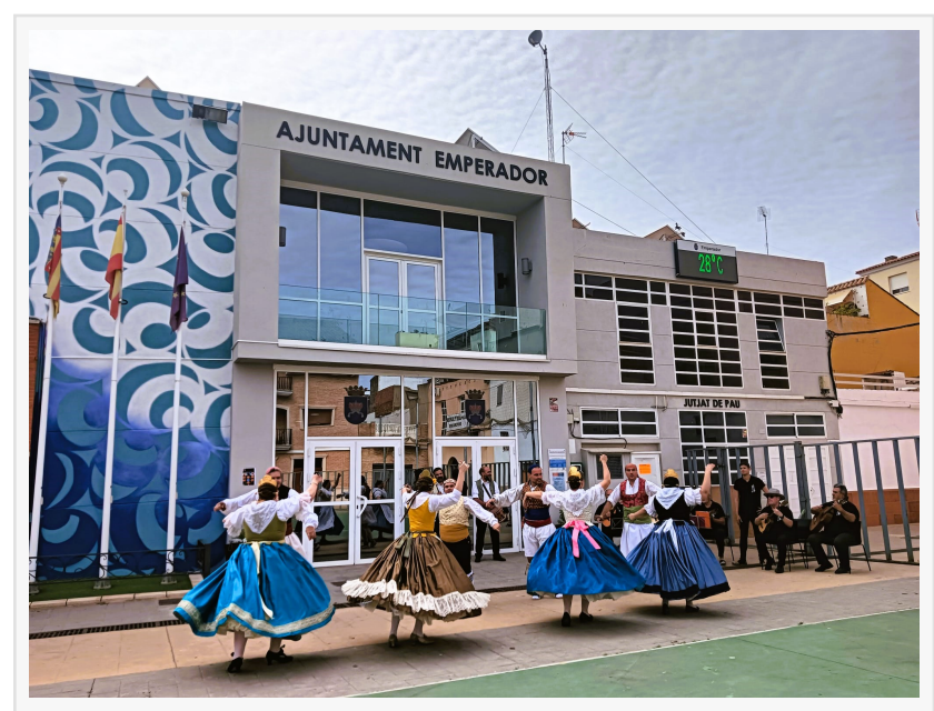
Grup de Dansa Santa Bàrbara in Emperador

This event was organized by the Grup de Danses Santa Bàrbara, with the collaboration of various cultural and educational institutions, including the International Association Cultural Itinerary The Way of the Holy Grail of Europe, the International Scientific Commission for the Study of the Holy