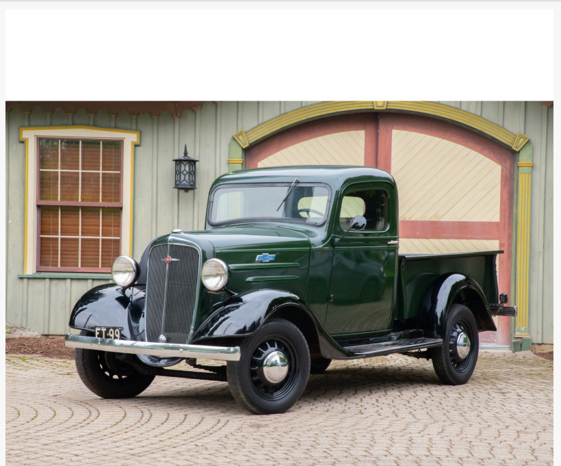
1936 Chevrolet half-ton pick-up truck, a true pre-war survivor truck, driven only 17,056 actual miles since new, with original 6-cylinder engine, paint and even tires (est. CA$25,000-$30,000).