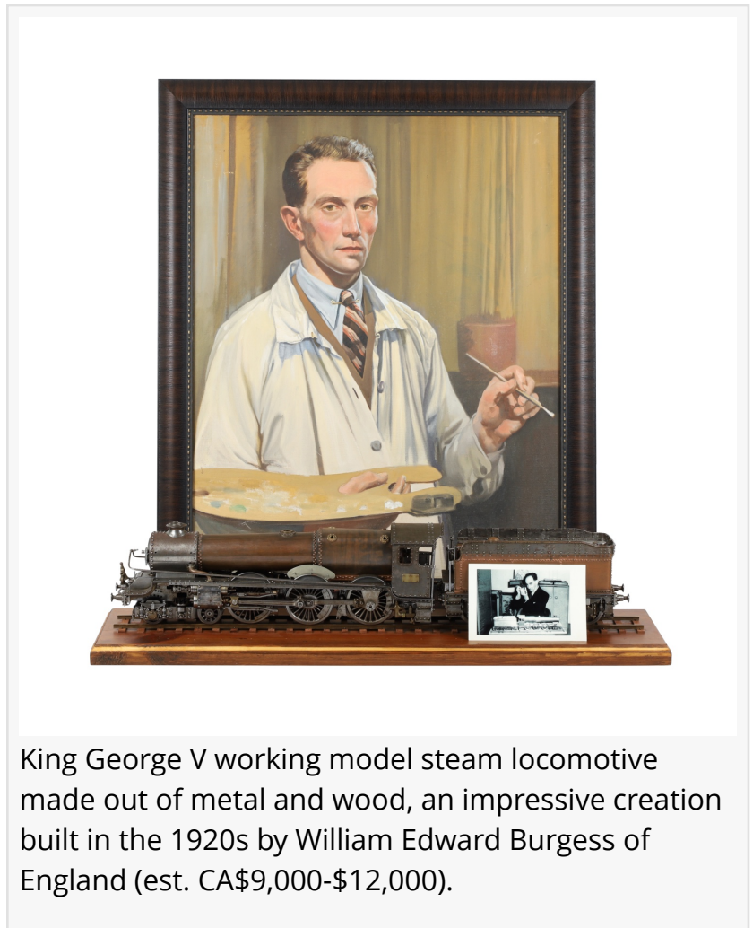
King George V working model steam locomotive made out of metal and wood, an impressive creation built in the 1920s by William Edward Burgess of England (est. CA$9,000-$12,000).

The second auction of the day on June 16th, titled Automobilia & Advertising, is an online-only affair with no live webcast stream. All lots will automatically close online at 5pm Eastern. This bonus sale features the niche market remains of the collections featured on Saturday and Sunday. The focus will be on early American automotive literature (Auburn, Cord, Duesenberg, Ford, Cadillac), along with parts, mascots, accessories, badges, pins, historical objects and more.