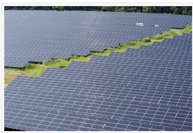
Huge Volumes of PV Panels

DEN HAAG, NIEDERLANDE, June 1, 2024 /EINPresswire.com/ -- GE4A Group (Green Energy for All) proudly announces the signing of the largest contract for used solar modules, securing over 15.8 million units. This milestone highlights GE4A's commitment to pioneering reUSE technology and digital energy systems, aiming to transform the renewable energy sector globally.